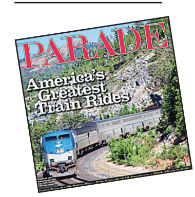
America's Greatest Train Rides

Proudly Serving Southeastern Colorado and Northeastern New Mexico • www.thechronicle-news.com