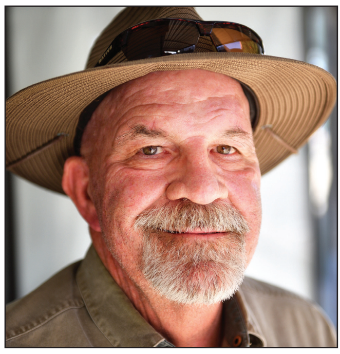
"I hope that we all survive the next four years. We're so polarized. People have drawn their lines in the sand and they're going to drive us to ruin. There are no handshakes anymore, no bi-partisanship. Just yell at each other and threaten. We have to find a middle ground but I don't see it coming."