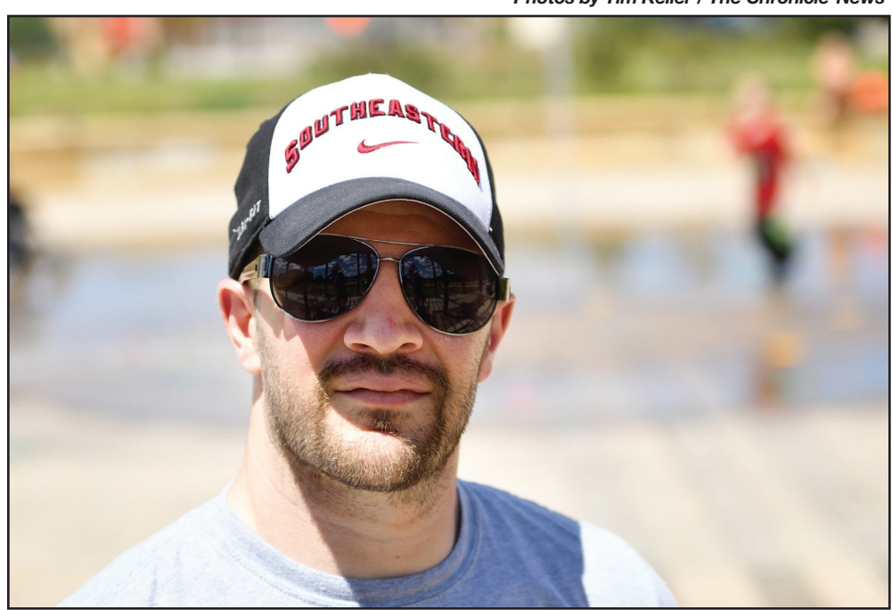
"Bringing my kids here to play in the water at Cimino Park, here or at the community-center pool. We try to come down at least every other day, as often as we can. They play in the fountains here."