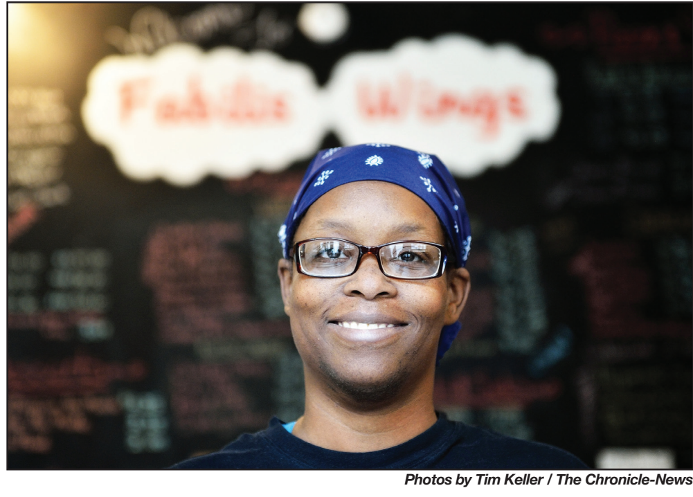
"Milk, eggs, butter, cheese and lettuce. You can never go wrong with butter and cheese. They make everything go better."

- D.J. Warren, "right hand," Fabilis Pizza & Wings, Trinidad