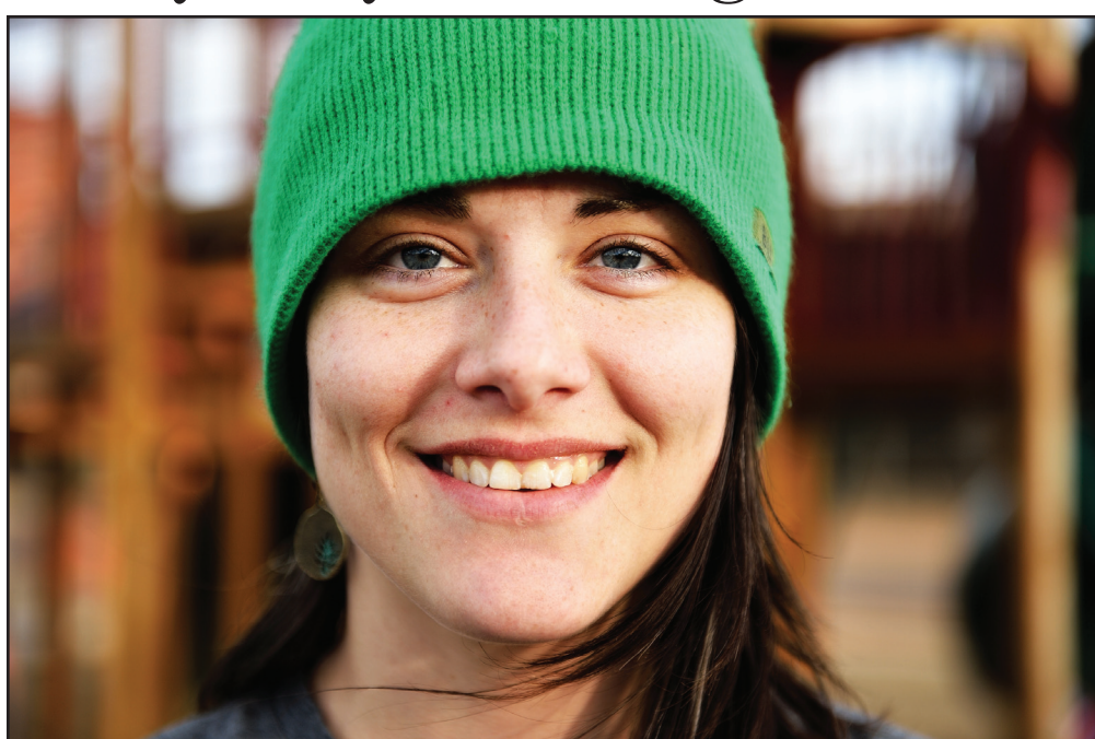
"Butter! It's so awesome. So many things that are delicious, they're delicious because of butter, including toffee, croissants, scones, a scampi sauce and lots of French sauces. Cows are awesome. Cream is awesome. Buttered toast is my go-to snack."