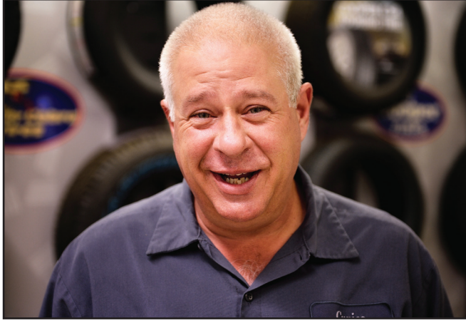
"I can't take a vacation because of my business. I can't take extended periods of time off. My big vacation each year is Thanksgiving. We close for one extra day and I go visit family."