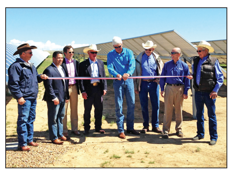
Ribbon Cutting

municipal electric system. USDA has a long history, dating back to 1935, of working with rural utilities to