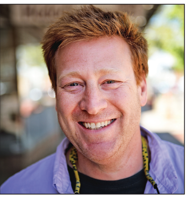
"I bought an Acura RDX for the reputation of the brand. It's a small SUV, big enough to do almost everything but it's good on gas mileage. It's a good car but not too pretentious."