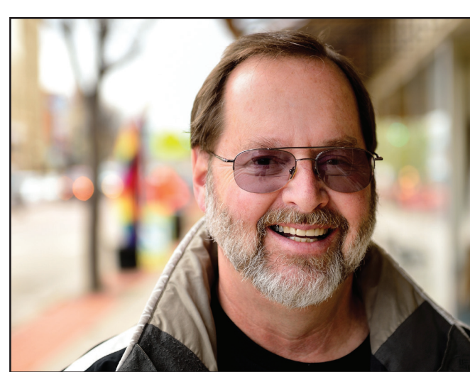
"I've read The Shack six times and shared it with each of my children. I last read it six months ago. The author wrote the book for his children. It's a Christian book about relationships with the Father, the Son, and the Holy Ghost, woven into a story."